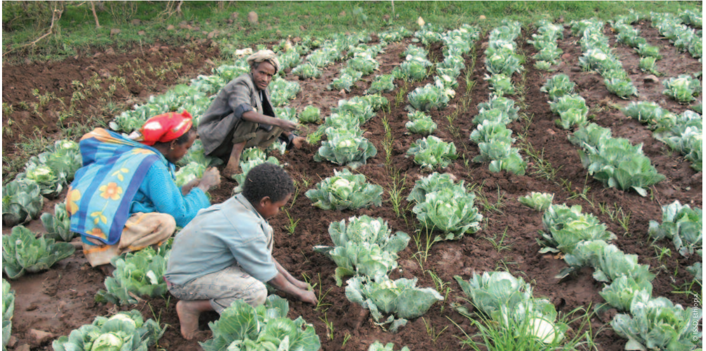
Planting finger millet between cabbages, Kewanit Ethiopia