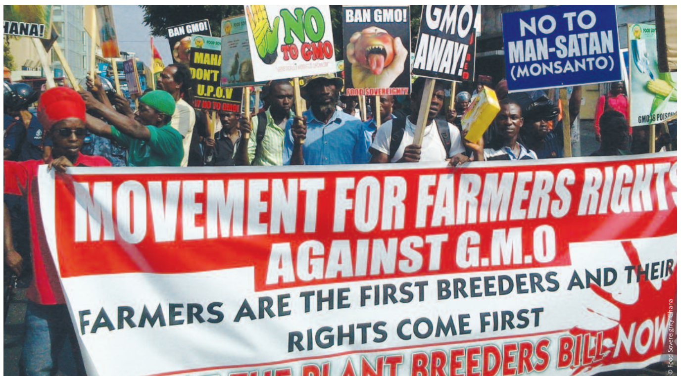
Protests in Ghana.