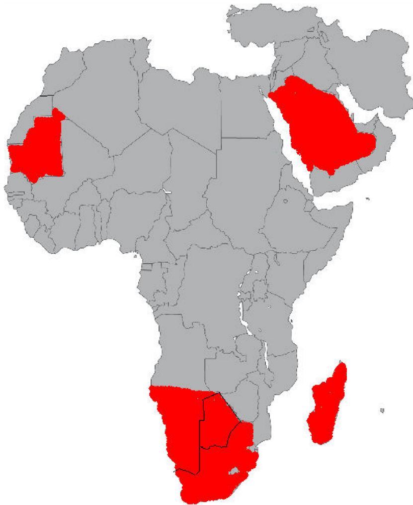
FIG. 1. Countries with confirmed cases of Rift Valley fever from July 2009 to November 2010 (indicated in red). Data were obtained from ProMed-mail (International Society For Infectious Diseases [ http://www.promedmail.org ]).

ticles possess a lipid-bilayered, enveloped virion, with the surface of each particle measuring 90 to 110 nm in diameter (15) and being composed of subunits of Gn and Gc heterodimers, forming an ordered icosahedral shell of 122 capsomers (29). Within the inner envelope of the virion, ribonucleoprotein complexes are layered proximal to the inner envelope, suggesting a possible interaction between the glycoproteins and the ribonucleoproteins (RNPs).