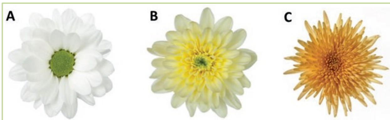
Figure 2 Three chrysanthemum flower shapes. A: single daisy type. B: double decorative type. C: double spider type. Adapted from Spaargren and van Geest (2018).

26. The applicant states that the parental cultivars of the five GM chrysanthemum lines included in this application are all double decorative (Figure 2B) or double pompon types. Pompon type flowers are similar to decorative type flowers but are globular rather than flat in shape (Kofranek, 1992).