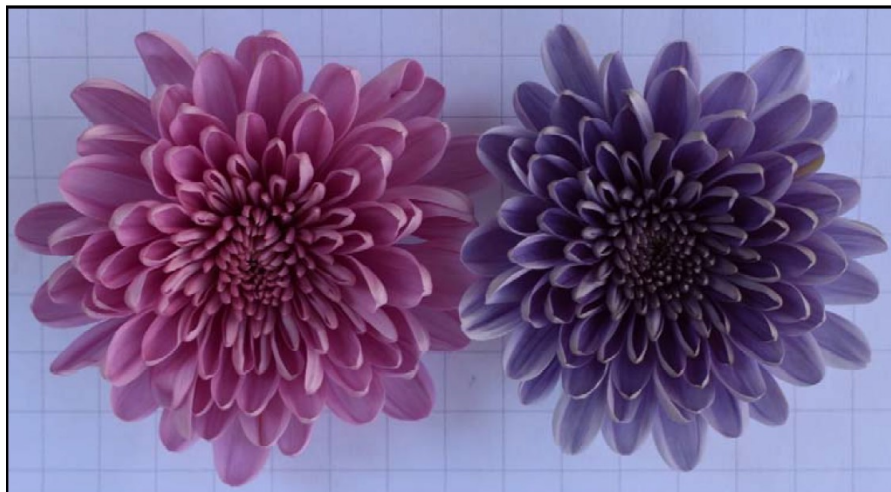
Figure 3 Flower of parental chrysanthemum cultivar T57 (left) compared to flower of transformed GM chrysanthemum line NS-203701-1 (right).

44. The five parental cultivars all produce flowers in hues of pink. The GM lines are genetically modified for altered flower colour and produce flowers in hues of violet or blue. An example is shown in Figure 3.