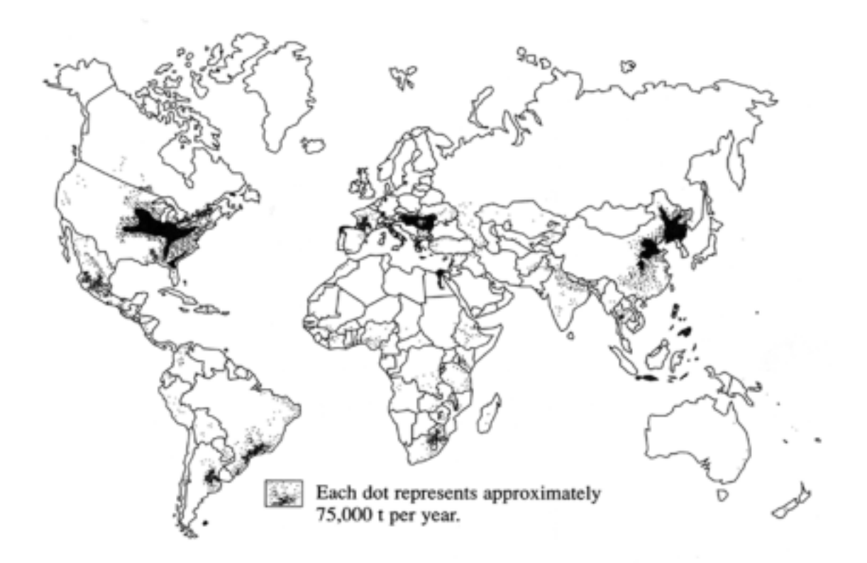
Figure 1. Maize production worldwide.