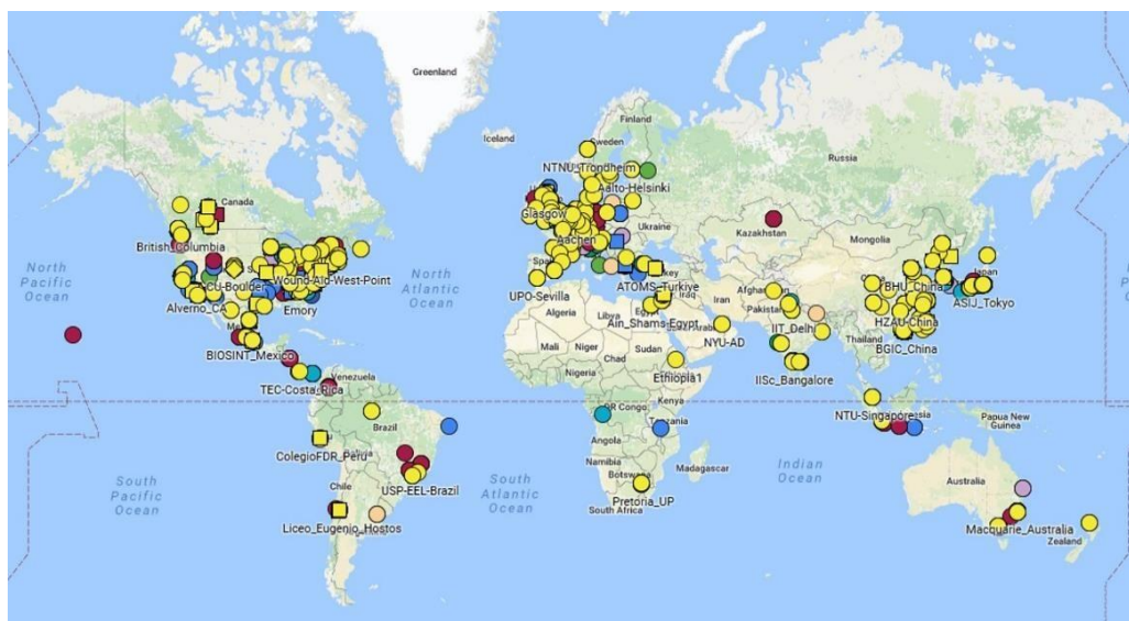
Figure 2. Teams participating in iGEM 2004-2016

Note: Colours represent the year in which a particular team participated in iGEM; circle=college team; square=high school team; diamond=community labs. Details available at: http://igem.org/About